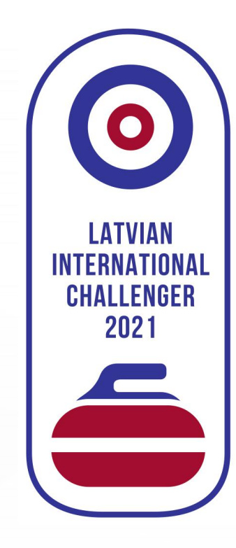
TUKUMS, LATVIA, 21-24/10/2021

Address: "Tīreļi", Slampe parish, Tukums region. T. +371 67730078, +371 26424972, www.kemerunacionalaisparks.lv